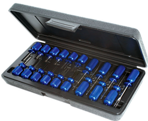
Terminal Tool Set | 4027