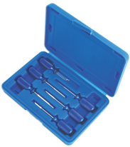
Terminal Tool Kit 6pc | 3984